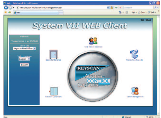
K-WEB Home Page

K-Web is the ideal solution for those who need, or want, true mobility. It allows you to manage core functionality of your Keyscan System VII software from any internet connection using an internet browser. Use Keyscan’s K-WEB module, to make quick changes on the fly, without compromising the security of your facility.