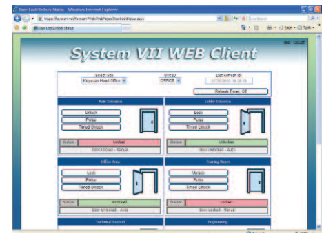
Door status control